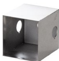
136# Stainless steel